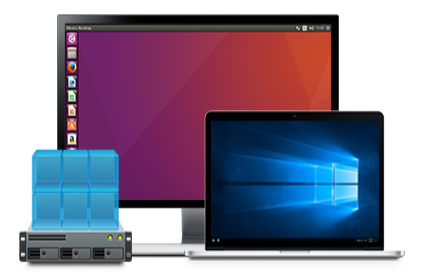
Virtual Machine Manager

With all the built-in and add-on features, DSM provides you with complete and fine-grained control of your DS1819+, maximizing your productivity and make the best out of your digital assets. All can be done with just a few clicks.