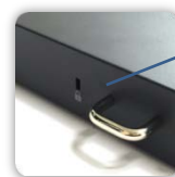
Kensington Lock & U-bar Lock